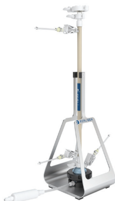
XCell ATF® 2 SU