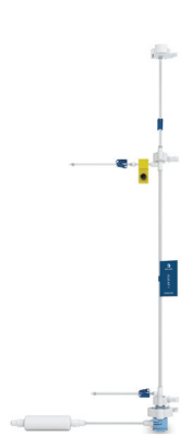
XCell ATF® 1 SU

XCell ATF® Lab Devices scale linearly from intensification development to manufacturing. Available in Single-use (SU) and Stainless-Steel (SS) formats, working volumes range from 0.5 L - 50 L. The XCell ATF® 1 Device provides the smallest working volume and features integrated accessories, including an AseptiQuik® Connector and a permeate pressure sensor. The 0.5 - 2 L XCell ATF® 1 working volume reduces media costs and provides linear flux and shear parameters for scale-up to 5000 L.