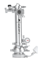
XCell ATF® 4 SS